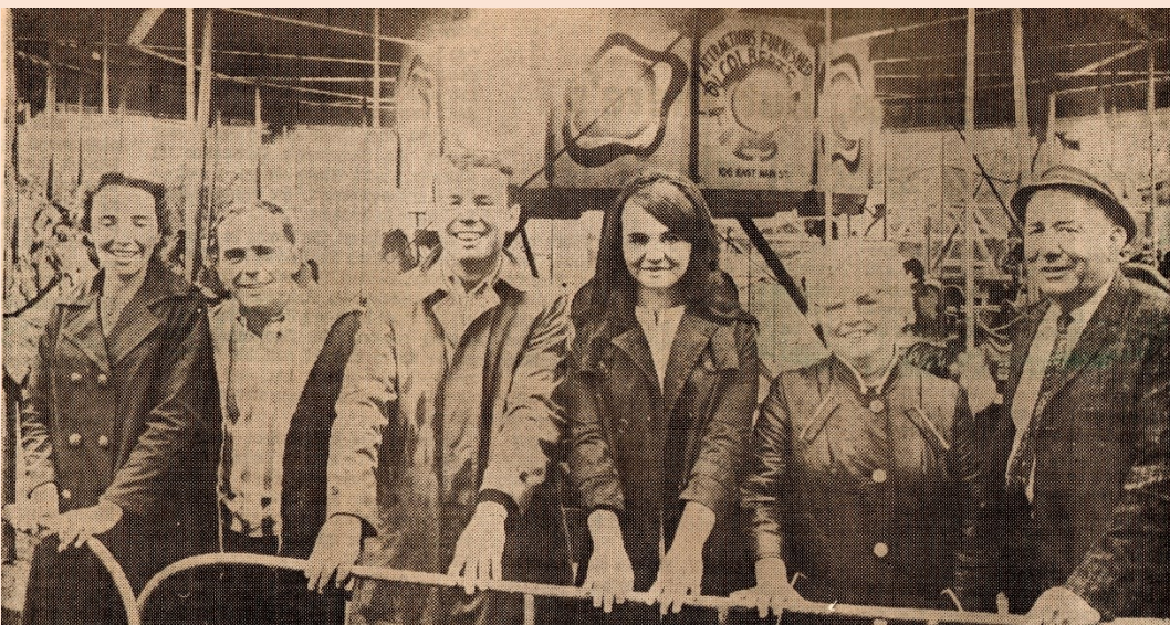
Merry -Go-Round Family of Traveling Carnival Folks